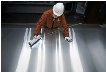
Litho.jpg: Quality check of aluminum at Hydro